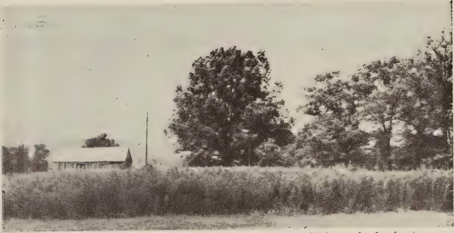
Block of our Tatarian Honeysuckle, 20,000 well branched plants.